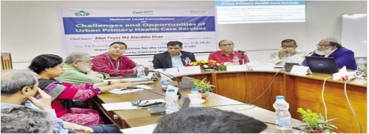
‘নগর এলাকায় প্রাথমিক স্বাস্থ্যসেবায় সমস্যা ও সম্ভাবনা’ শীর্ষক মতবিনিময় সভায় অতিথিরা