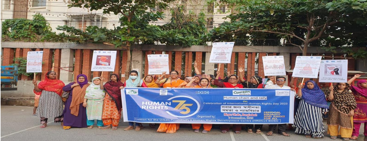
Human Chain at link road section 7, Mirpur