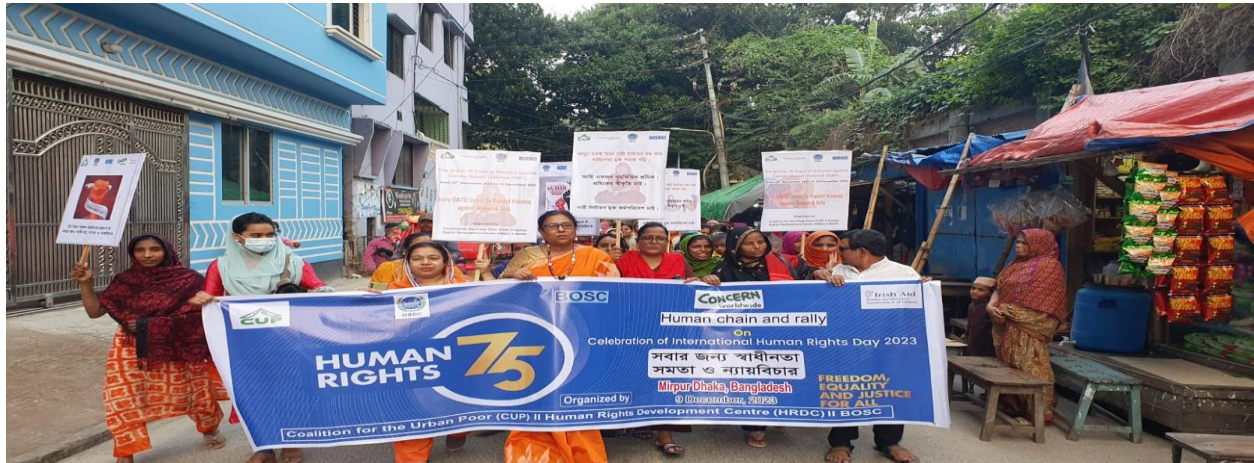
The rally started from Bareker bosti ,section 6 Mirpur.

More than 100 persons were attended the rally most of them were women. After the human rights day observation CUP ED khondker Rebaka Sun-Yat closing the 16 days of activism activities 2023 which started from 25 th November 2023.