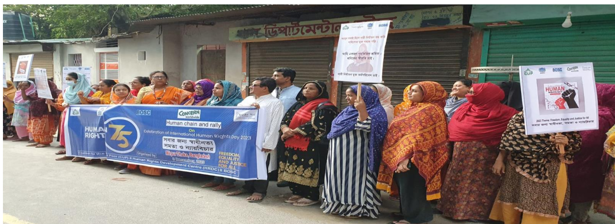
Human Chain at link road section 7, Mirpur.